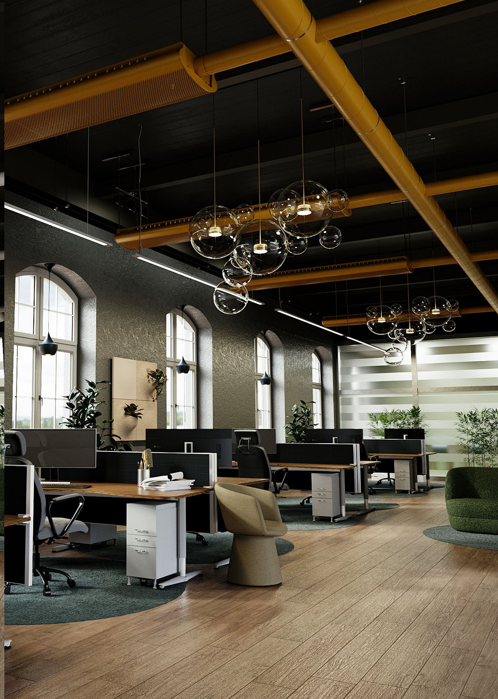
ADRIATIC in two different colors