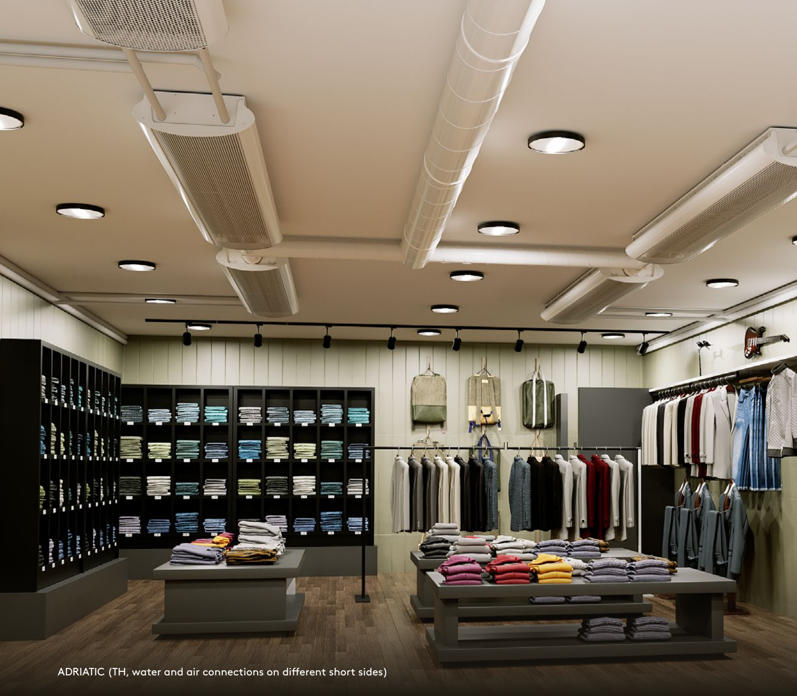
ADRIATIC (TH, water and air connections on different short sides)