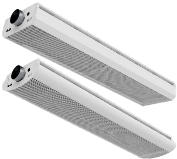
ADRIATIC with setting knob

The product can be integrated in the WISE system as a constant air flow beam with optional control of supply water valves.