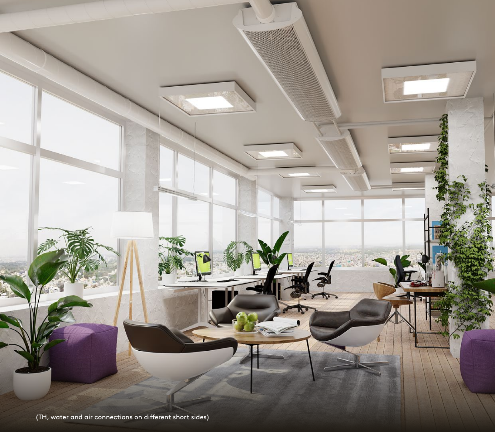
(TH, water and air connections on different short sides)